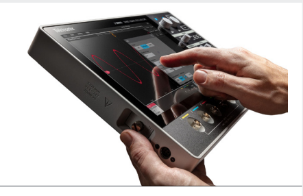
Intuitive 10.1-inch capacitive color touchscreen with simplified user interface enables quick access to any function.