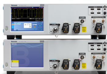
DP070000SX ATI Performance Oscilloscopes

Boost the performance, reliability, and efficiency of your tools to be AI-ready!