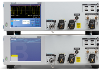
DP070000SX ATI Performance Oscilloscope